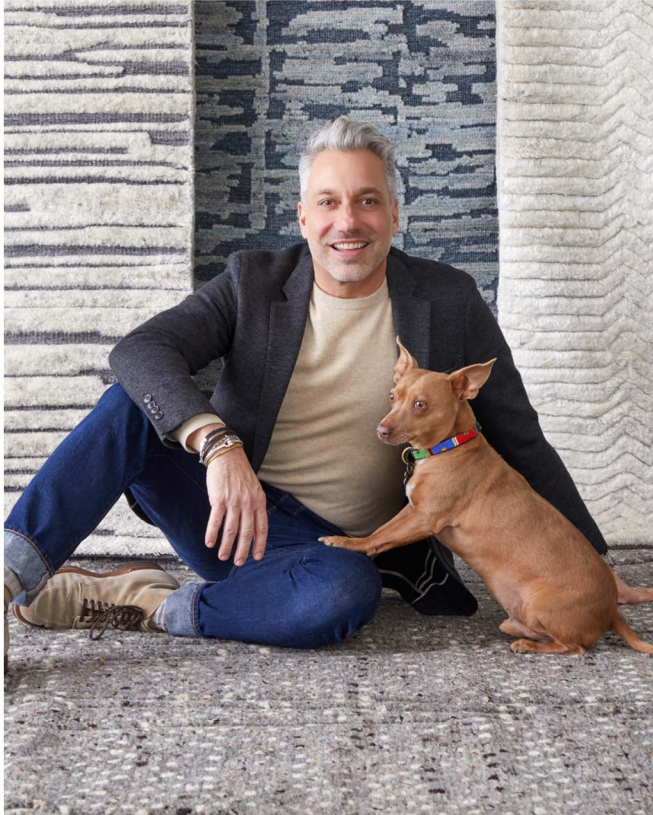
Thom Filicia, Thom Filicia Inc